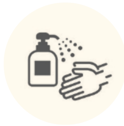
Hand disinfection at check-in