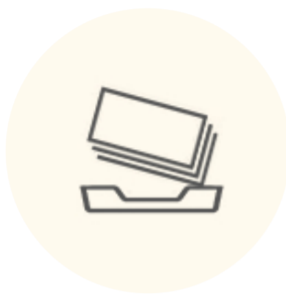
Pay on the tray