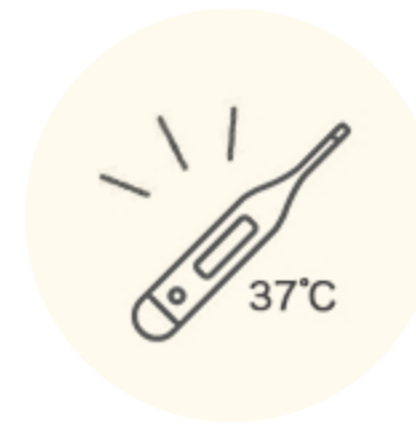
If you are unwell, please let the staff know