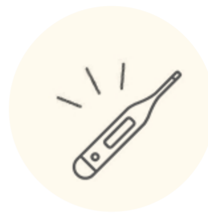
Take the temperature