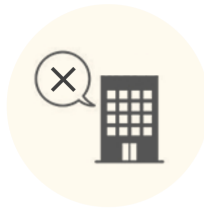
Depending on the symptoms, we may refuse to stay.